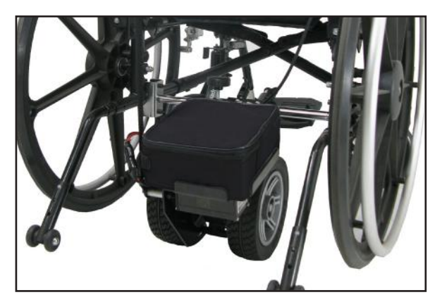
The Power Assist Battery Pack

The information contained herein is correct at the time of publication; due to the manufacturer's commitment to constant improvement and development, they reserve the right to alter specifications without prior notice.