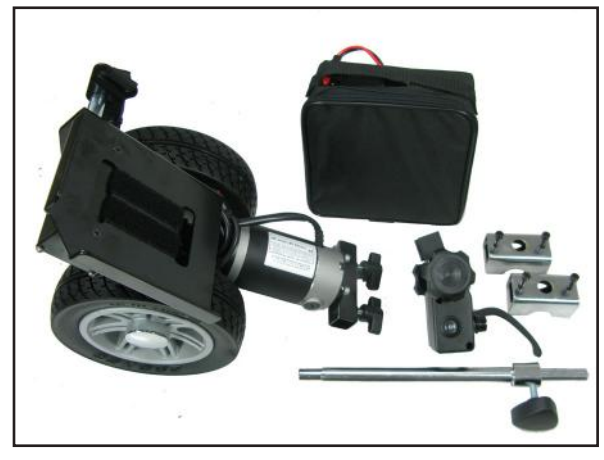
The Power Assist Unit