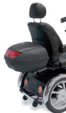
Sport rider with rear pod

The information contained herein is correct at the time of publication; due to the manufacturer's commitment to constant improvement and development, they reserve the right to alter specifications without prior notice.