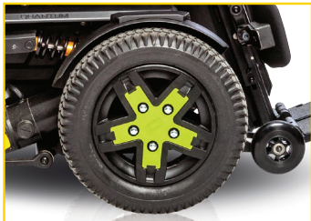
Drive Wheel Colour Accents